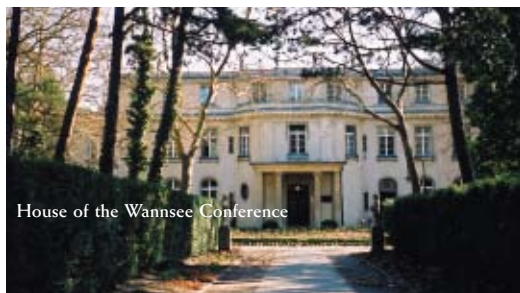
House of the Wannsee Conference

Top to Bottom: Reidstag - Berlin, Jewish Memorial - Berlin, Schloss Cecilienhof.