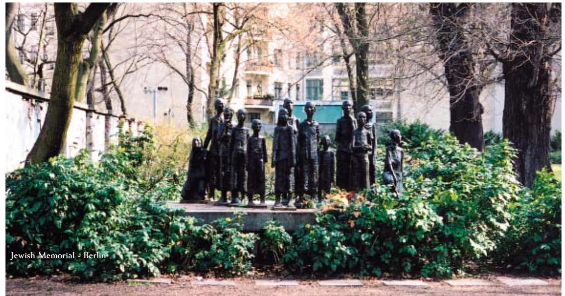
Jewish Memorial - Berlin