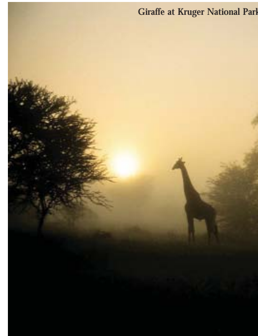
Giraffe at Kruger National Park

The Kruger National Park is one of the most famous wildlife parks in the world as well as one of the biggest and oldest - established in 1898 by Paul Kruger. The Kruger has one of the greatest varieties of animals in Africa including the 'Big Five', lion, leopard, elephant, buffalo and black rhino as well as cheetahs, giraffes, hippos and many species of antelope.