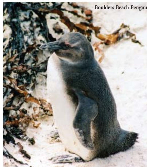
Boulders Beach Penguin