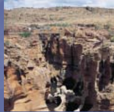
Top to Bottom: South African Lady, Elephant, Bourkes Luck Potholes.