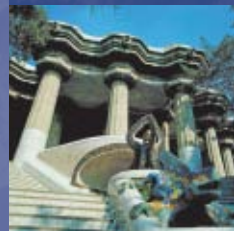
Top to Bottom: Gaudi architecture; Olympic Stadium; Park Guell.