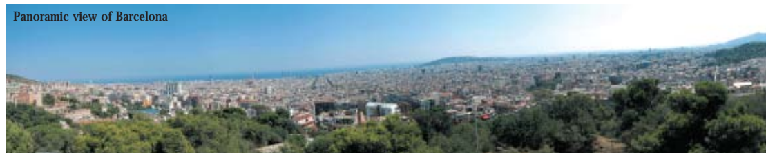
Panoramic view of Barcelona

Barcelona is a young, vibrant city with excellent transport links - trains, trams and buses - which make it incredibly easy to travel around. The weather too is generally very favourable with mild winter temperatures and warm summers. Feedback from returning groups is always very positive making Barcelona one of our most popular destinations for educational and cultural tours.