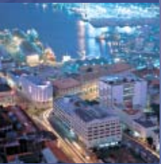
Top to Bottom: Typical Beach Scene, Local Trader, Colombo.